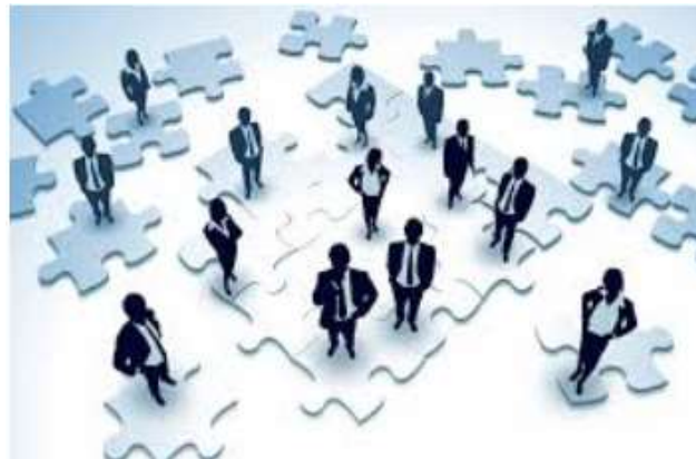
Lack of Integration