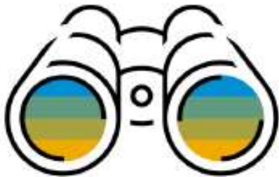
Lack of Visibility